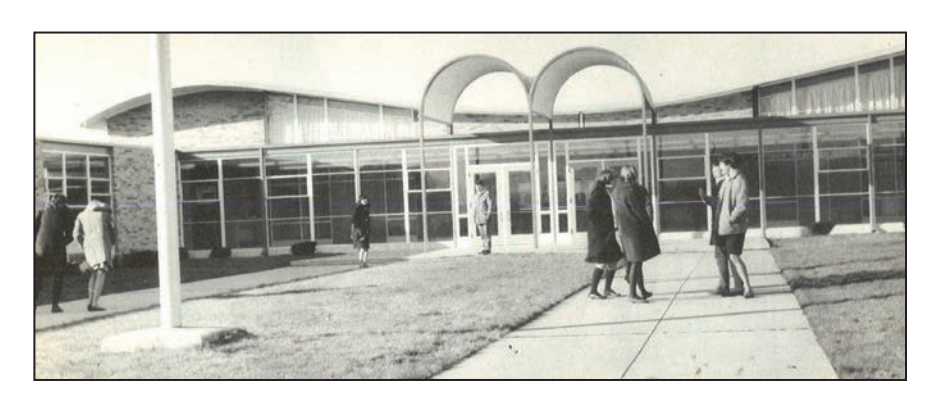
Chippewa Valley High School in 1965.

The members of the 1965 football team will lead the 2015 team onto the field, participate in the coin toss and deliver the game ball. Halftime will also feature some special recognition and announcements. The classes of 1965 and 1966 have an entire weekend of celebrations planned including a golf outing and an evening dinner reception. For more information or to get in touch with the committee, call the Office of School and Community Relations at 586-723-2240.